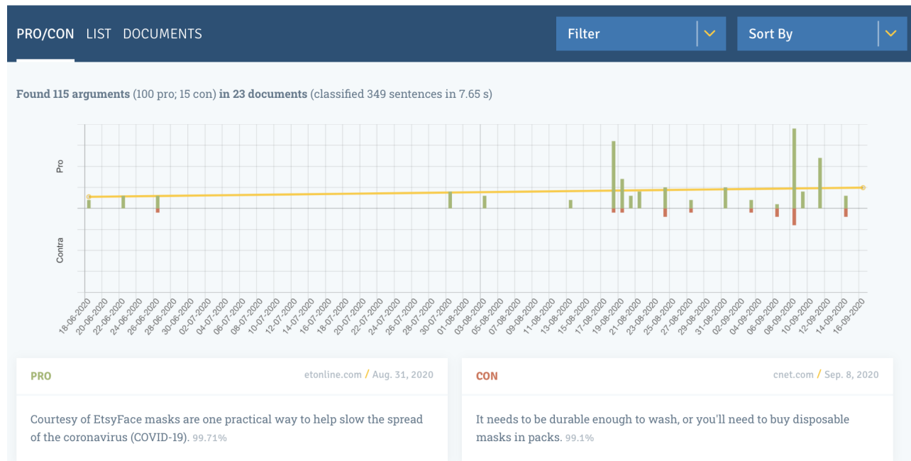
Figure 1: The current user interface of the search engine including the argument trend as bar chart and the first pro- and con-arguments discovered for the query “face masks”. Screenshot taken on September 16th, 2020.

list of at most 250 URLs and metadata (e.g. timestamps) of matching web articles.